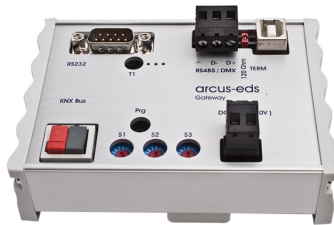
KNX-GW2-RS232/RS485 Art.-No.: 40210186

Depending on the command length, approx. 1200 serial commands can be stored on the KNX-to-serial gateway. The group addresses used are defined together with the command chains to be sent in a project file and transferred via the USB interface. The physical address is set using the configurator.