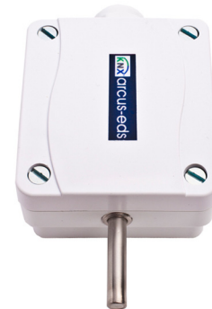
SK10-TC-ATF2 External Sensor