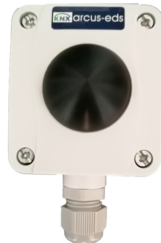
SK10-TC-RSTF Dark Radiation Sensor