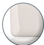
B100PADS-SA Silver - Aluminium