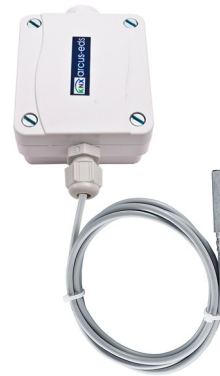
SK10-TC-OFTF Contact / Surface Sensor 1.5m PVC