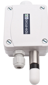
SK10-TTHC-AFF + ext. PT1000 Connector