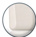
MTPXS-MF Silver - ABS